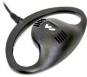
Figure 1. Over-ear speaker. Not compatible with TCoil. Hearing aid not required.

Over-ear speakers and inductive neck loops are available. The neck loop is for people with TCoil-equipped hearing aids. People who do not wear hearing aids or whose hearing aids do not have a TCoil can use the over-ear speakers.