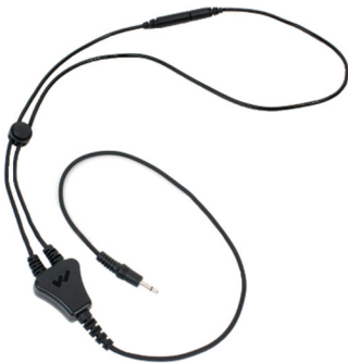
Figure 2. Neck loop. Works with Tcoil-equipped hearing aids and implants.