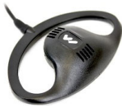
Figure 1. Over-ear speaker. Not compatible with TCoil. Hearing aid not required.

Over-ear speakers and inductive neck loops are available. The neck loop is for people with TCoil-equipped hearing aids. People who do not wear hearing aids or whose hearing aids do not have a TCoil can use the over-ear speakers.